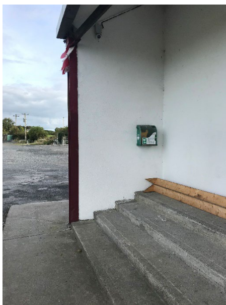
Location of AED cabinet