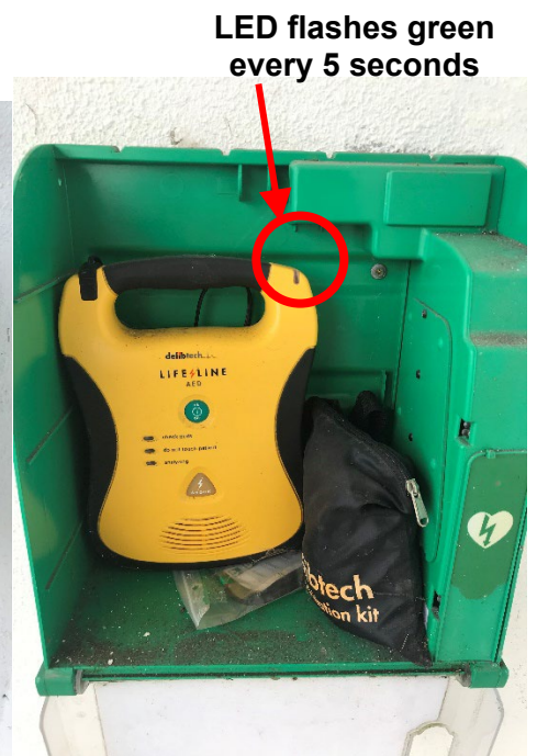
AED inside cabinet